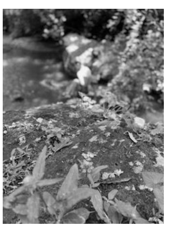
Est. 1982 A Ministry of Bethel Campgrounds, Inc.